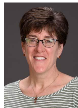
Hosted by Ellen Millender

For more information contact Collette 1-800-581-8942 Refer to booking #1323780